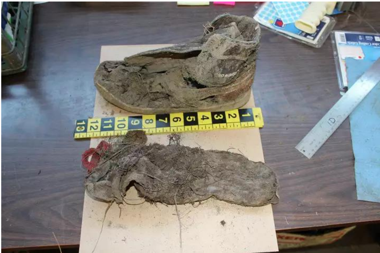
A sneaker and a sock found on Warren Hawkins' body in 2012. Photo taken around the time of discovery.

The case, referred to as the "Skeleton in Sneakers" case due to the remains being found with their feet sticking out of the ground and sneakers pointing skyward, began with a chilling discovery on Oct. 29, 2012. According to news website Redheaded Blackbelt , a local family kayaking and mushroom hunting near their home in Piercy, California, uncovered a sneaker partially buried in the ground. Initially dismissing it as trash, they investigated further upon spotting a second sneaker. When one shoe was dislodged, it revealed human foot bones, along with denim pants and a visible leg bone. The family reported the finding to law enforcement, leading Mendocino County sheriff's detectives to the site.